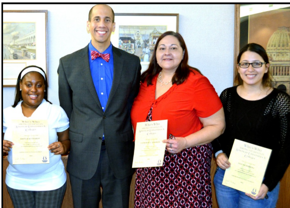
Who’s Who ceremony

Students at institutions across the nation are nominated each fall for the Who’s Who Among Students in Higher Education Award. Honorees are selected for outstanding academic achievement and service to the university and community at large. The following members of the McNair Scholars Program were selected for the award this year: