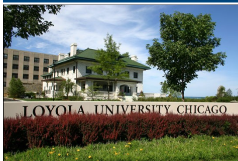
Scholars go to Loyola Campus